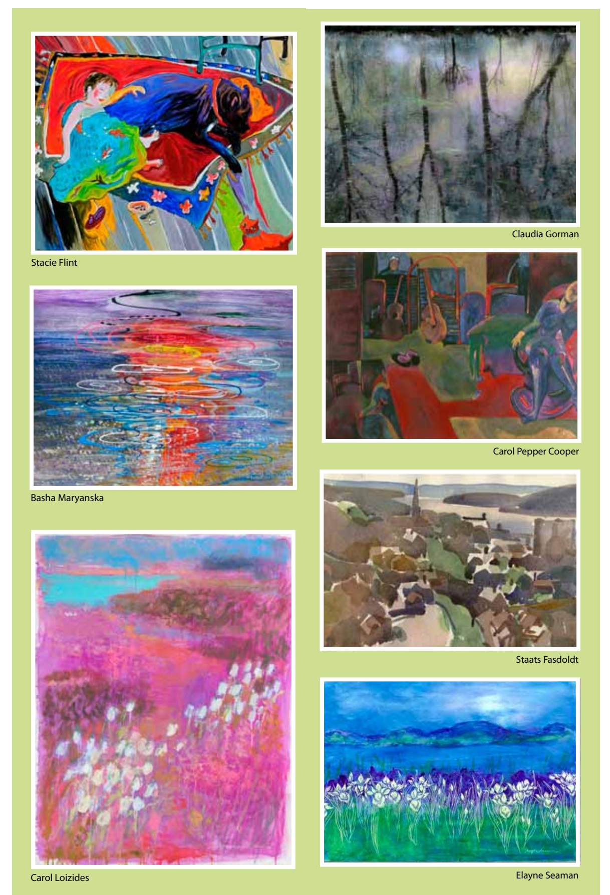
Saturday, June 4 - Long Reach Arts Opening